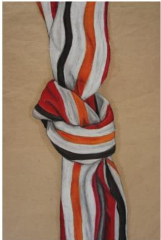
Oil pastel knot drawing

While drawing is an important method of researching, investigating and developing ideas across all areas of study, it can also be used as a form of descriptive and expressive mark making in its own right and as the medium for final resolved work.