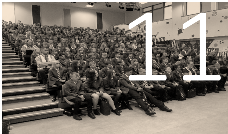
Careers and Post 16 opportunities