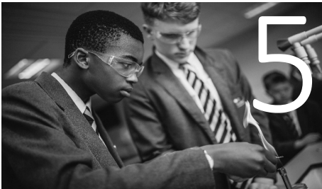
Academic Achievement for ALL