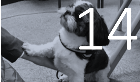
Milly the school dog & Academy Day