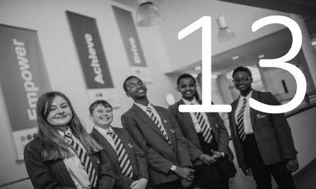
Achievement & Behaviour