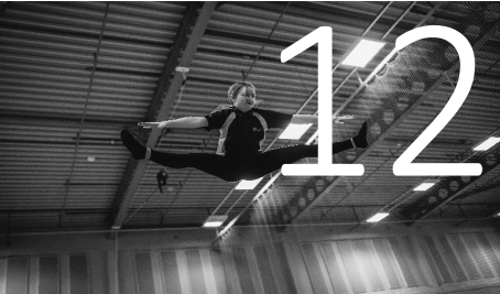
Extra Curricular activities