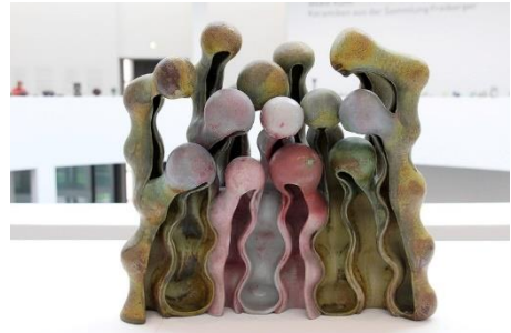
Small Family by Beate Kuhn 1988